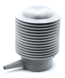
Figure 5: 3D printed air pump