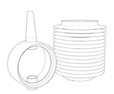
Figure 4: Air pump design

• This air pump is composed of two parts: a bellow and air valve. It blows air out when the bellow is pressed.