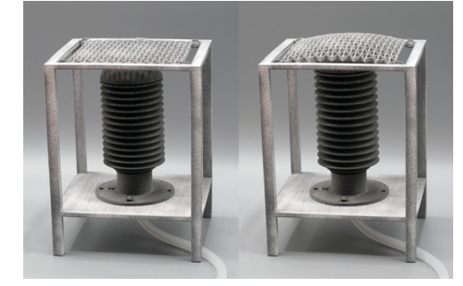
Figure 11: 3D printed pneumatic device