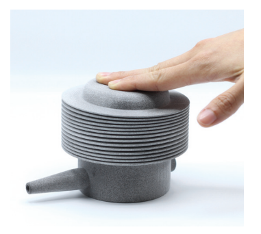
Figure 6: Bellow being pressed

• This musical instrument makes a funny sound when played. A 3D printed whistle also can be attached to make a more tuned sound.