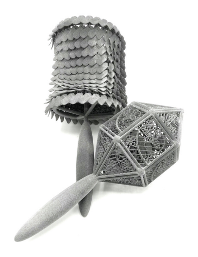
Figure 1: For example, thin mobile pieces that contact each other when shaken can create a soft, silvery sound

An often-overlooked aspect of a 3D printed part is the sound it makes. We can deliberately design parts to achieve particular sounds.