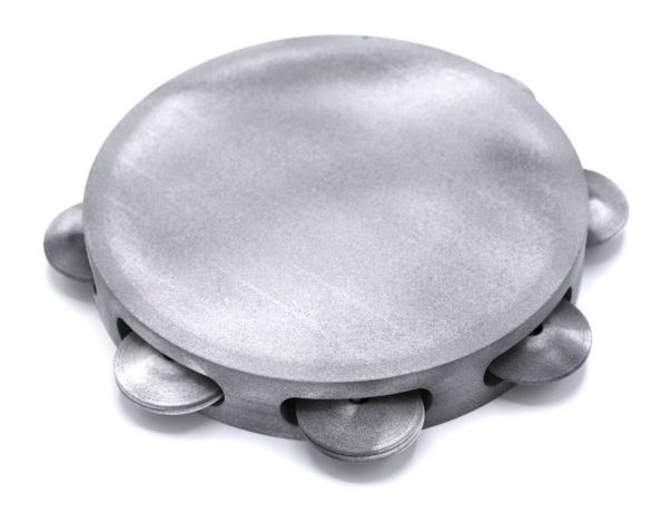
Figure 3: You can also 3D print percussive membranes, like the tambourine pictured above. Printing the tambourine with the membrane side down at a 30-degree angle helps avoid warpage of the membrane