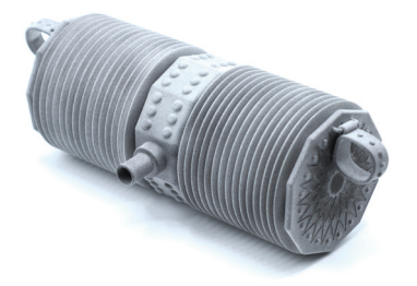
Figure 8: 3D printed musical instrument