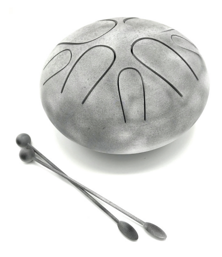
Figure 2: Large hollow parts with reasonably thin walls and holes can create a nice resonance. In the example above, the cut-out "tongues" on the drum act like cantilevers. The tone they generate is a function of the mass of the cantilever and is therefore controlled by thickness, length, shape, and cross section